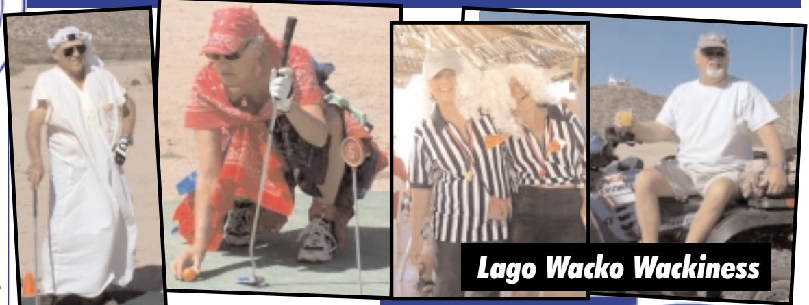
Lago Wacko Wackiness

E aster, or Semana Santa, is fast approaching. Many of our members have left or will be leaving shortly for cooler climates. We, on the board, want to wish each of you a safe journey, and we will look forward to seeing you next season. As we look back on this year, the club life has never been busier. We all have favorite stories of an activity or a meal. Many of us have developed new friendships that will last longer than anyone would believe. Kino Bay is a very special community.